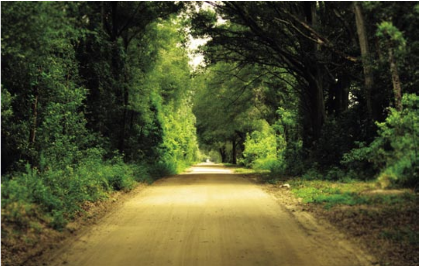
The drive along Avington Road

uplands; minimizing the construction area; creating a bird and butterfly habitat; and reintroducing native plants to the area. Approximately 90% of the land will remain naturally vegetative, something unheard of in development in Central Florida.