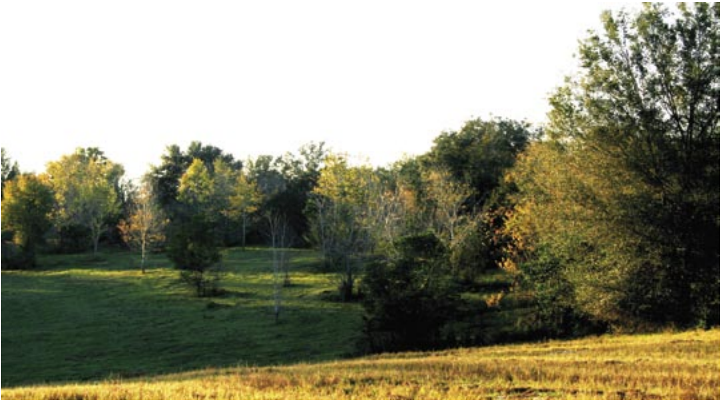
Rolling hills and beautiful oak trees.