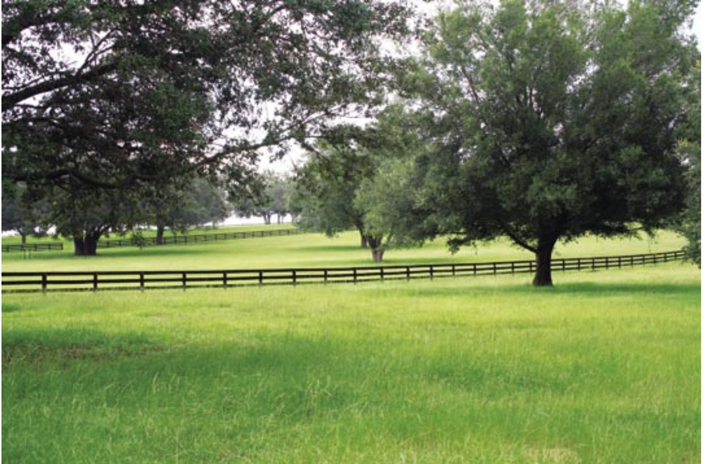
A beautiful view along Wolfbranch Road

"We wanted the opportunity to enhance the environmental value of the land and provide a peaceful retreat for our homeowners," explains Damian Winterburn of Heritage Green. "You simply